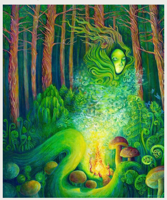
Propagating art, ancient wisdom, nature love, cosmic wonder and third eye nourishment.