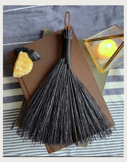
Hand-tied brooms for everyday ritual.

www.etsy.com/ca/shop/OldCrowBroomCo Instagram: @oldcrowbroomco