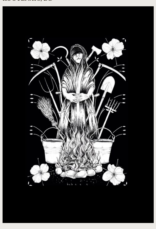
Botanical Posters, Prints, Stickers www.bubzeeart.com/shop