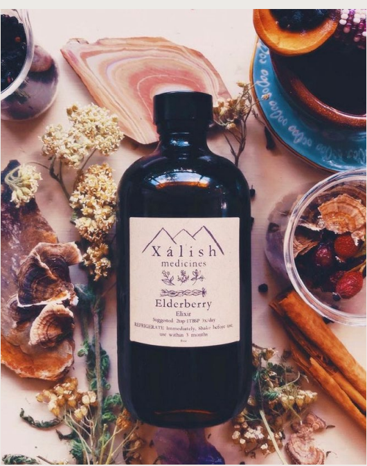
Reawakening our inherent Connection to Mama Earth & Ourselves

www.xalishmedicines.com/shop Instagram @among_the_wildflowerss