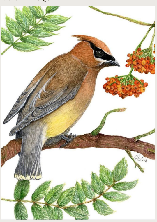
Vibrantly-detailed watercolours of botanicals + nature.